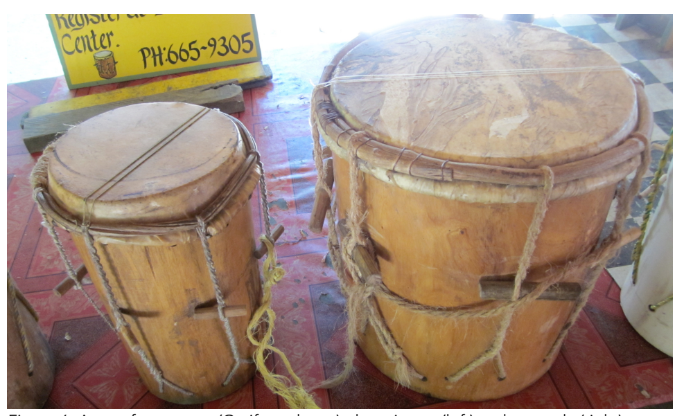
Figure 6: A set of garawoun (Garifuna drums): the primero (left) and segunda (right). 2010, Hopkins, Belize.

Garifuna music is based on an ensemble of drums, called garawoun . There are two sizes of drums used in this music: the primero (smaller, improvisatory lead drum) and segunda (the larger bass drum that plays a steady repeated pattern). Garifuna musical ensembles also features shakers called sísira , hollow turtle shells which are struck with sticks, and conch shell trumpets. Traditionally, Garifuna women compose songs and are the primary dancers, while men are drummers. The three most important rhythms within Garifuna music are the punta , paranda , and hüngühüngü . Teaching this music tradition to Kalinago in St Vincent has proven to be a very important aspect of cultural reclamation.