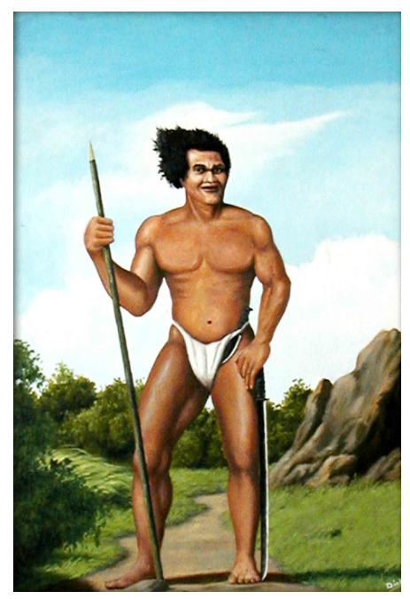
Figure 3: "Carib Chief, Chatoyer" by Lennox 'Dinks' Johnson (2002). Reproduced with permission from the artist.