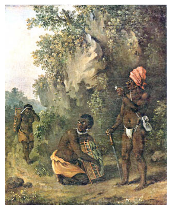
Figure 2: "Chatoyer, the Chief of the Black Charaibes in St Vincent with his Wives" by Agostino Brunias (1773)