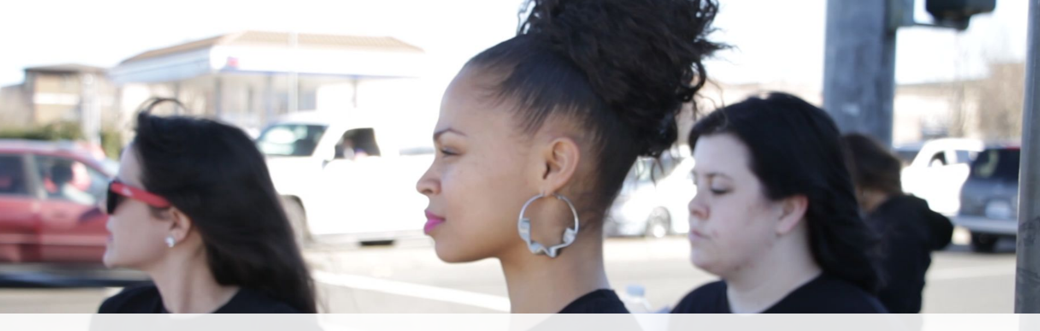
"As long as they see it as just some girl who's just selling herself, they're never going to feel empowered to protect children and women of these communities." - Leah Jonet Albright-Bryd